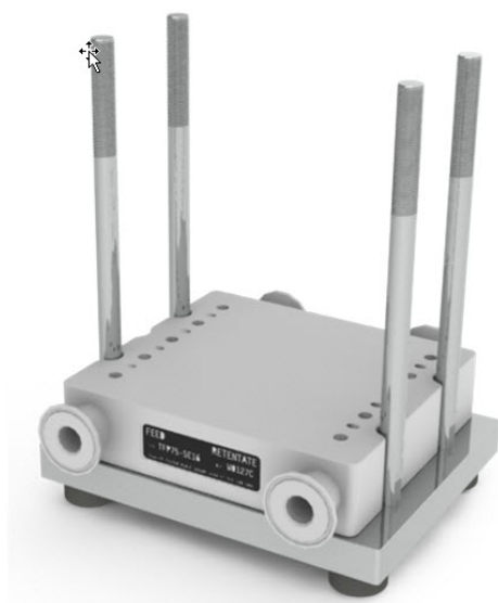
Figure 6.1 Sanitary fitting connections